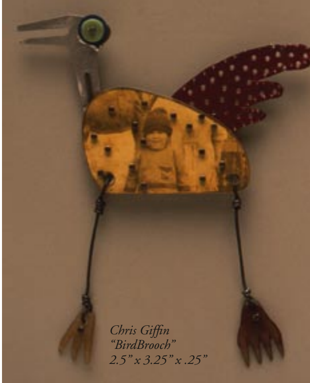
Chris Giffin "BirdBrooch" 2.5" x 3.25" x .25"

Peacock's work inhabits the world of a future that might have been. His creations are inspired heavily by the Buck Rogers anything-is-possible optimism of 1940s science fiction. They reflect the exuberance of big tail fins, the confidence of Disney's Tomorrowland, and the whimsy of the Jetsons.