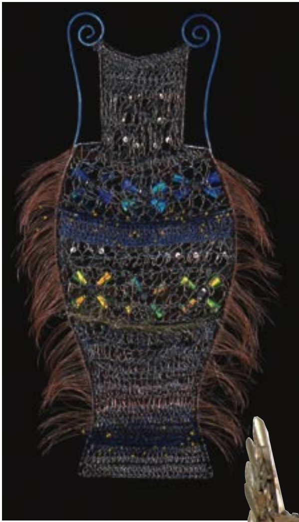
Bonnie Meltzer "Reflection Vessel" 45" x 28" x 7" Crocheted wire, found objects

thing from nothing") alongside State Route 706 outside the west entrance to Mount Rainier National Park. "I look at that as my canvas. I love having my pieces out there for people to view."