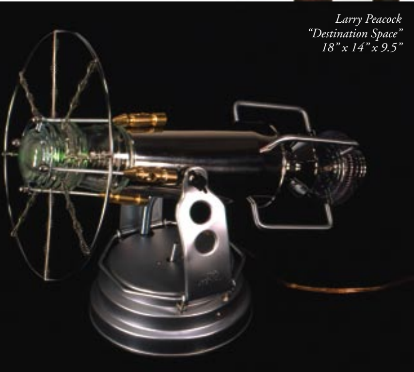
Larry Peacock “Destination Space” 18" x 14" x 9.5"

and scrounging—by making metal sculpture from found objects. That was over 30 years ago.