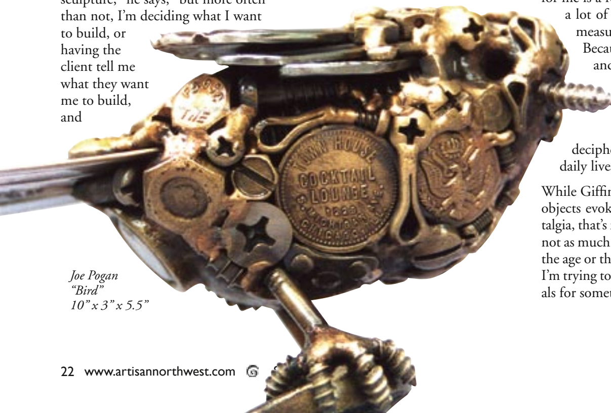
Joe Pogan "Bird" 10" x 3" x 5.5"

While Giffin admits that her use of old objects evokes a certain feeling of nostalgia, that's not why she uses them. "I'm not as much trying to bring attention to the age or the vintage of the materials as I'm trying to just use them as the materials for something contemporary."