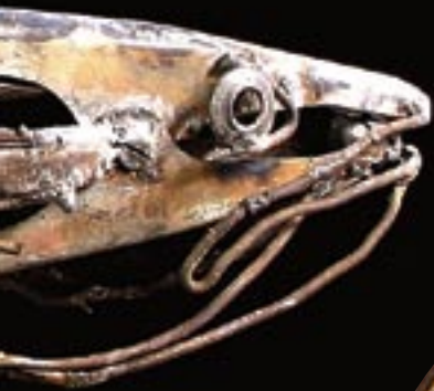
Greg Congleton "Spring Loaded" Detail 28" x 10"